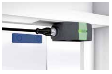
RST16-1 Plexiglas door: flat design, discreet appearance