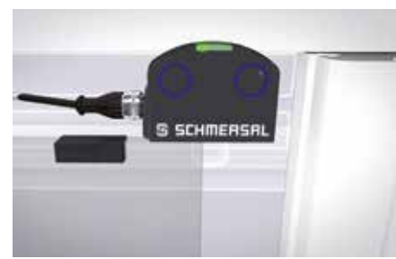
RST-U-2 Sliding door: Smallest size, embedded in Plexiglas