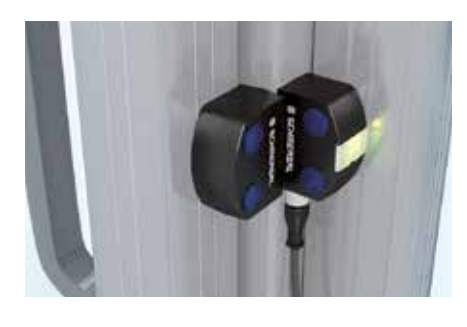
RST260-1 Swivel door with frame, no interfering contour of the door cutout